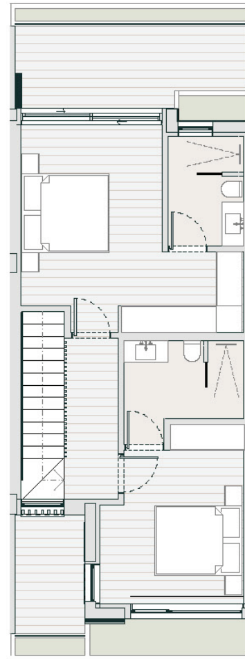
1 st Floor