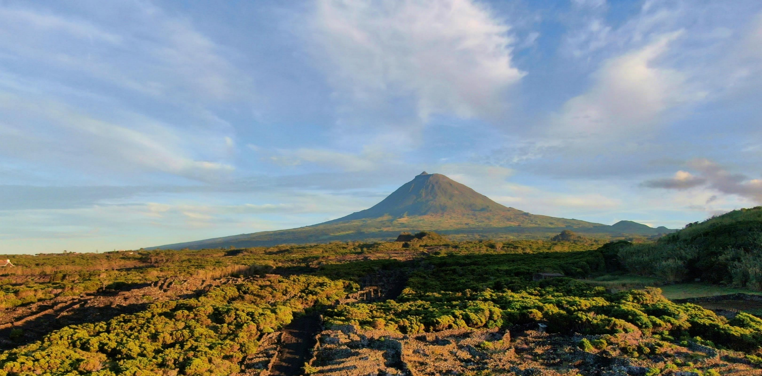
The Pico mountain view from the houses