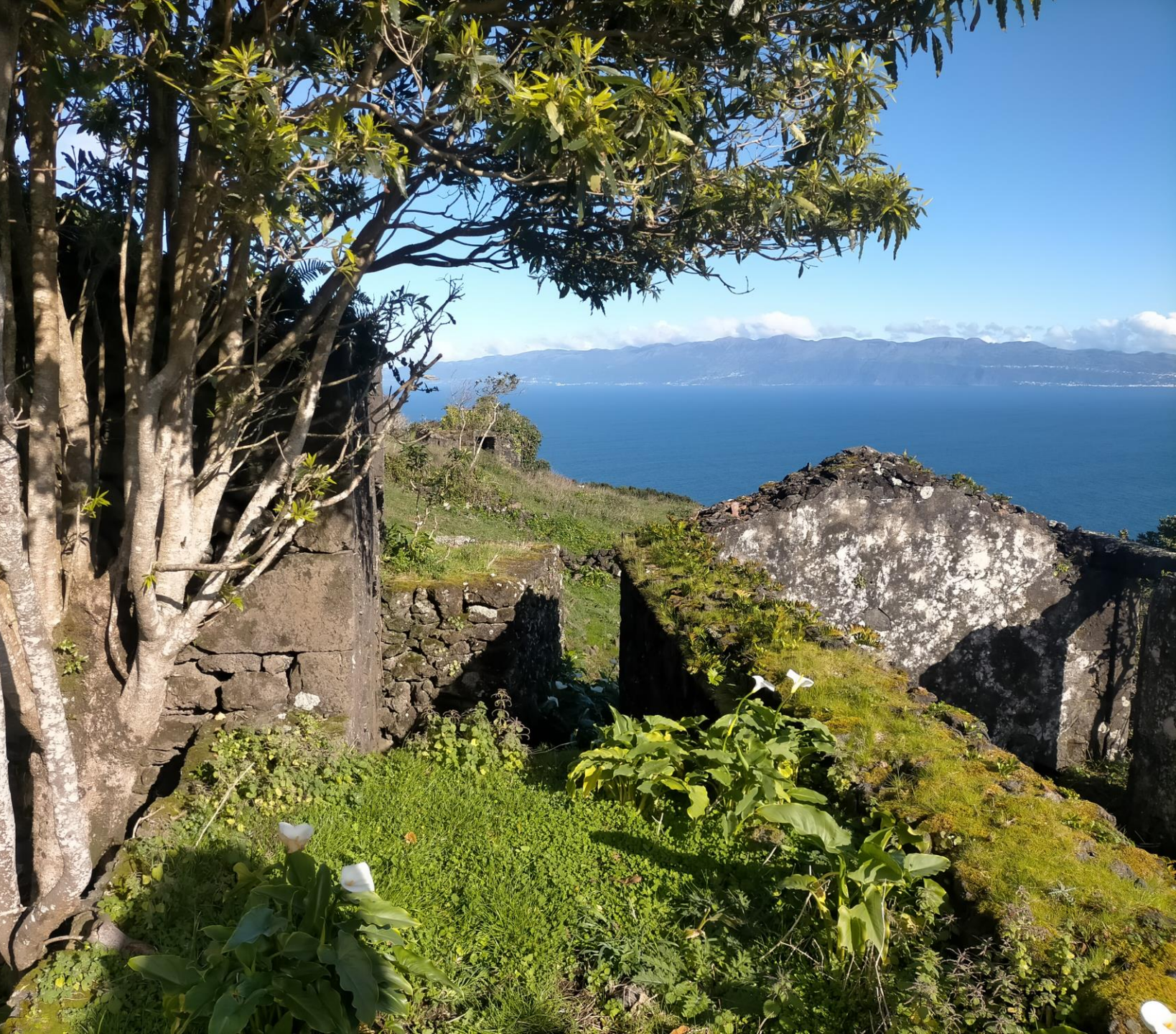
Terraços da Ribeirinha | Ilha do Pico