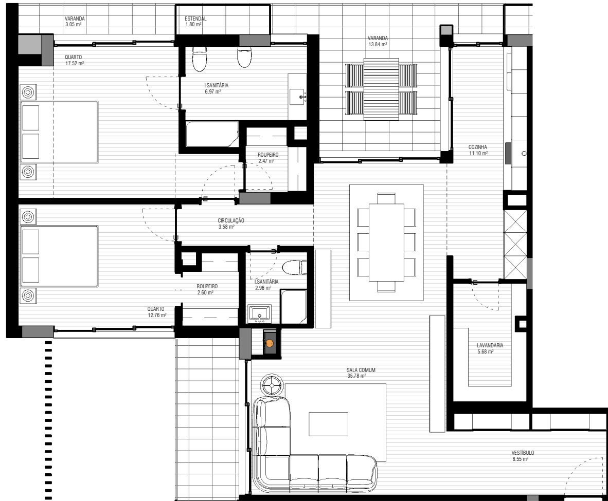
I - FRACÇÃO 1:100