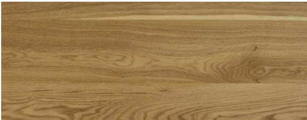
Image 6 – “Trevo Floors” flooring in the color Oak Prime 155 Brushed