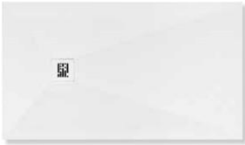
Image 20 – Stone shower tray