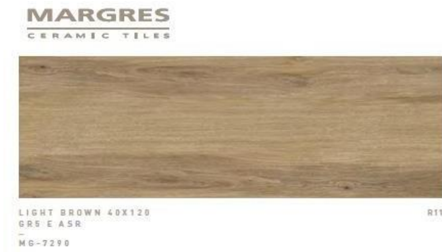
Image 1 - Ceramic from Margres ref 412 GR5.Light Brown R11